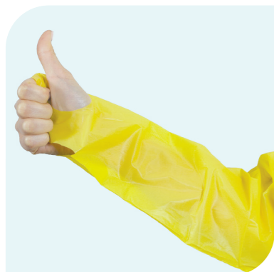
Thumb Secure Protective Gown