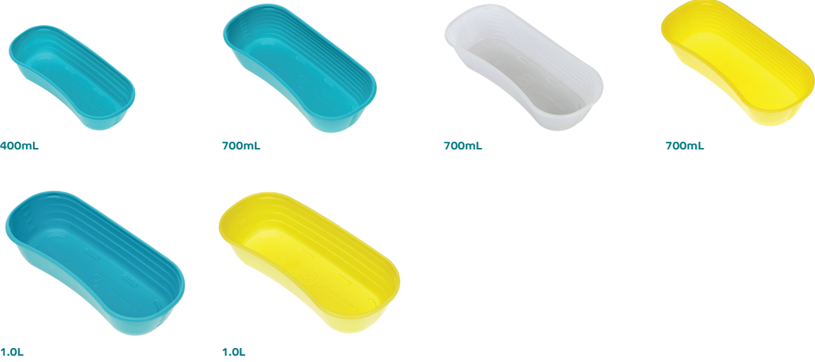
TABLE KEY: (T) Teal, (C) Clear, (Y) Yellow, [GHG] Greenhouse Gas Emissions, (R) Recycle, (L) Landfill, (I) Incineration.